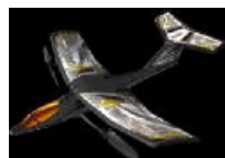
V-Jet Full Tilt