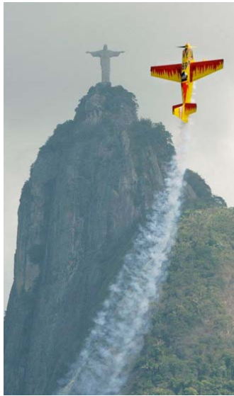
An interesting likeness...

We hope you all had a wonderful Easter with your family / models!