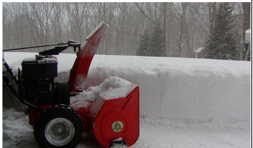
12 Hours snow fall - Fortunately not local!

With most of us filling our days with the fruitless pleasures of things like work, DIY, or even watching television; I'm sure you'll all join me in wishing away this ridiculous weather and hoping for some sunny, windless days so that we can all get back into the air again.