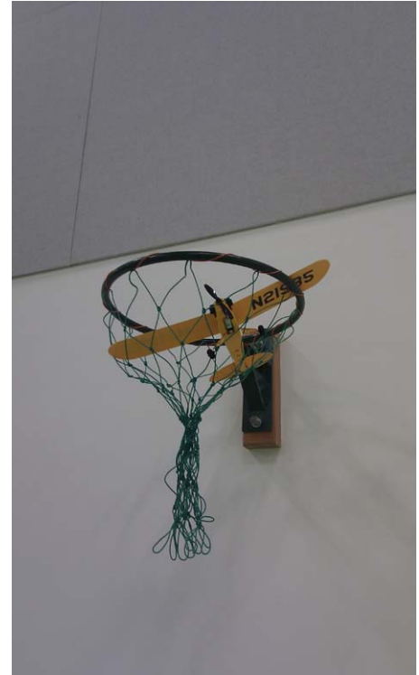
Not quite a swish!