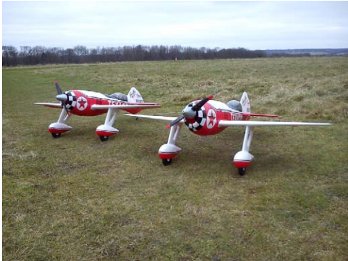
The GeeBee's Parade

Well I can hardly write this piece without mentioning the weather. To say it has been rubbish is of course an understatement and, as a result, we are still having to be careful at Bovington with the state of the ground, especially for parking. If you are going to Bovington, and especially if you are the first there, please have a look at the ground conditions before attempting to drive to the normal parking area and, if it looks too wet, park on the track in the wood or just outside.